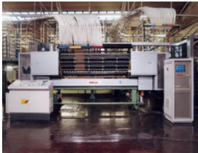
Level cut loop with full repeat scroll attachment.

The 'LCL' yarn feed can be by conventional dual yarn feed attachment. Precisely the same amount of yarn is metered to the needles for each stroke of the needle bar. Carpet patterns and texture can be further enhanced when LCL is used in conjunction with a Multi Roll or Full Repeat Scroll pattern attachment.